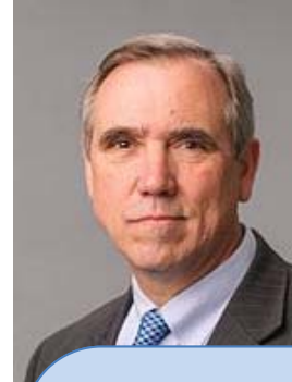
Sen. Jeff Merkley